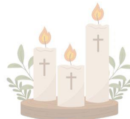
(Donation for Remembrance Flame is $10)